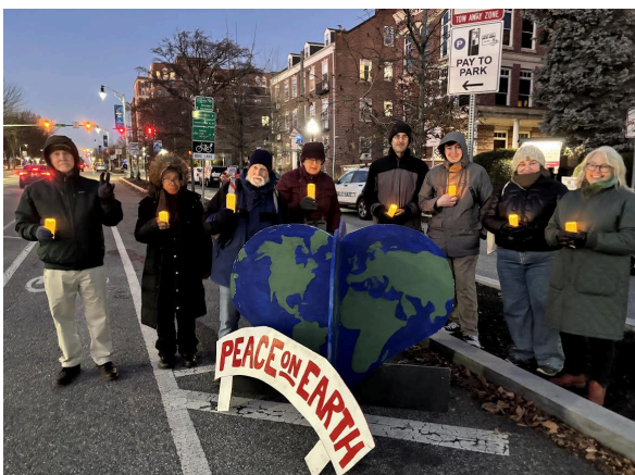
Vigil in front of the meetinghouse on 12/20/25

Read the full Query's advices: BYM Faith and Practice, p 27.