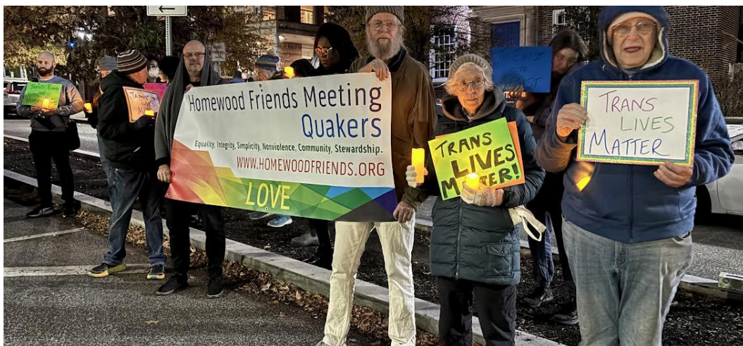
Trans Day of Remembrance, 11/20/25. Read our Public Minute on Trans and Nonbinary Support.

Read the full Query's advices: BYM Faith and Practice, p 23.