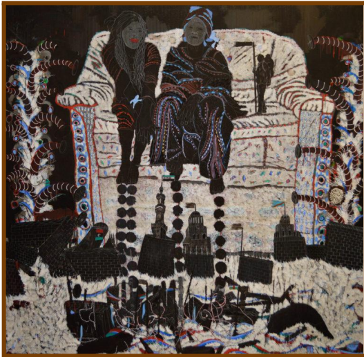
Omar Ba, "Les Autres (The Others)", Senegalese artist now on exhibit at the Baltimore Museum of Art until 4/2/23.

camps more financially accessible to young people of all backgrounds.